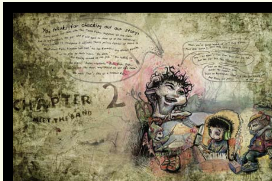
Darling, disgusting toenail fairies! Vulgar visuals!